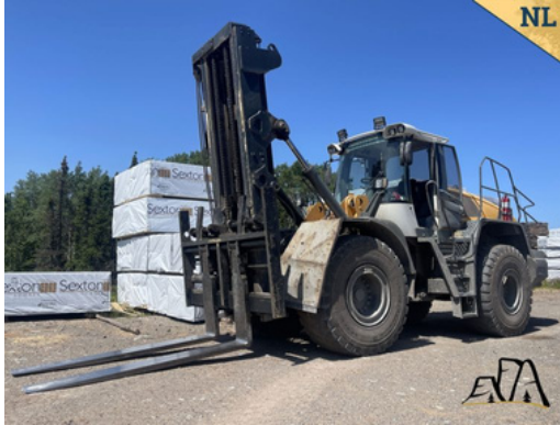
2014 Liebherr L550 Loader/Forklift Asking $129,900