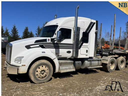
2020 Kenworth T880 Sleeper Truck $165,000