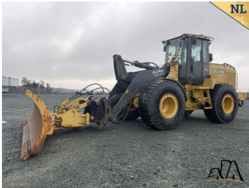
2012 Deere 624K Wheel Loader Asking $164,900