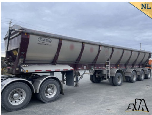
2018 Trout River 45' Q/A Live Bottom Trailer Asking $77,500