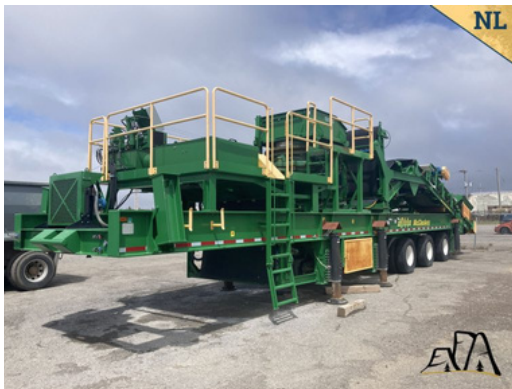
2018 McCloskey C44 EW Cone Crusher Asking $950,000