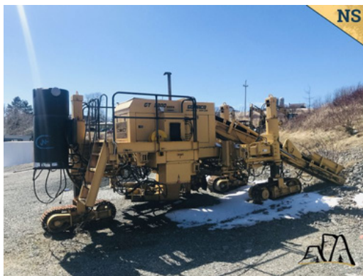
2002 Gomaco GT3300 Curb & Gutter Machine Asking $59,500