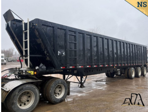
2021 Deloupe 46' Tri/A Demolition End Dump Trailer Asking $60,000