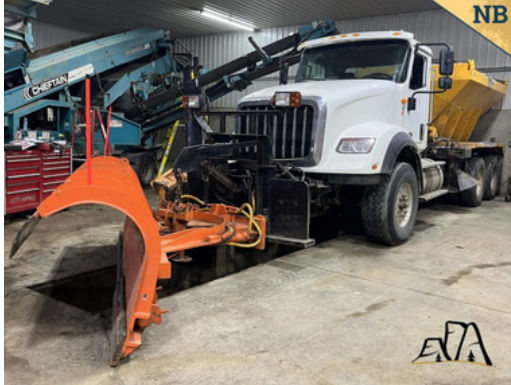
2019 International HX620 Plow/Spreader Truck Call for pricing