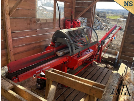
2021 Hakkipilke Falcon 35 Firewood Processor Asking $27,900

SALES@EASTERNFRONTIER.CA TEL. (709) 700-5886