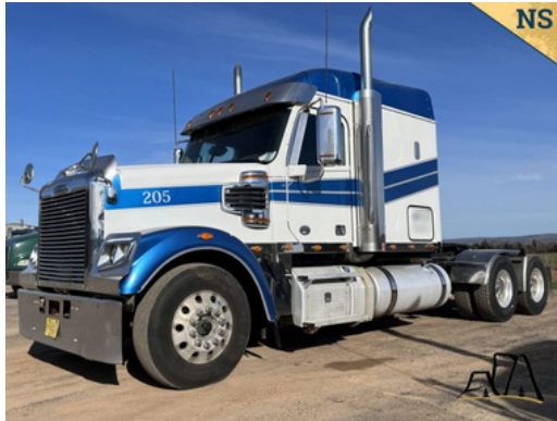
2020 Freightliner Coronado 122SD Sleeper Truck $99,500