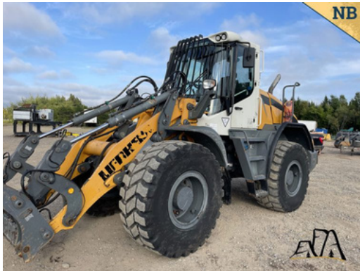
2015 Liebherr L542 Wheel Loader Asking $145,000