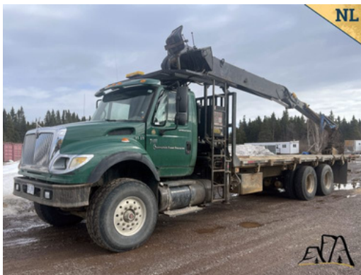
2004 International 7600 Boom Truck Asking $70,000

*for DUMP TRUCKS, see pg 9 *for TRUCK TRACTORS, pg 11