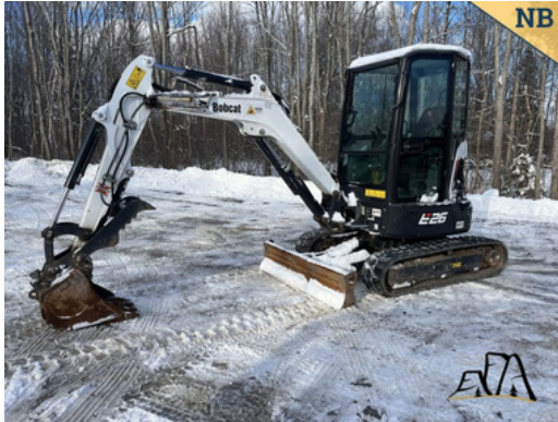
2022 Bobcat E26 Hydraulic Mini Excavator Asking $57,000