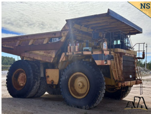
2002 CAT 777D Rock Truck Asking $77,500