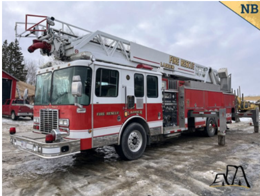
1997 Rosenbauer HME Fire Truck Asking $26,000