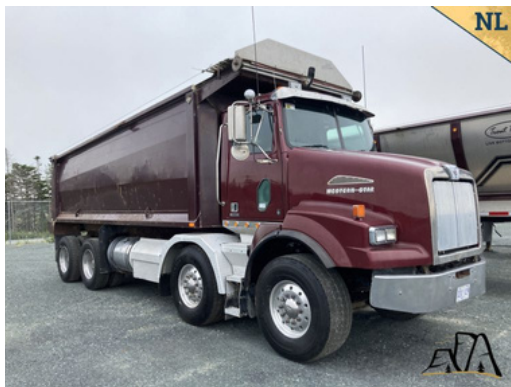
2018 Western Star 4800 Dump Truck Asking $185,000