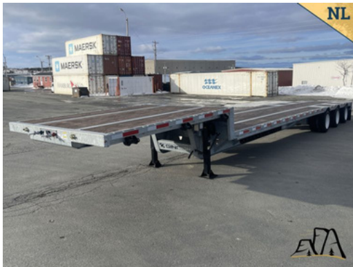
2023 Gincor 53' Tri/A Drop Deck Trailer Asking $85,000