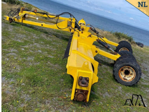
Tardiff TV1118 Land Leveller Asking $25,000