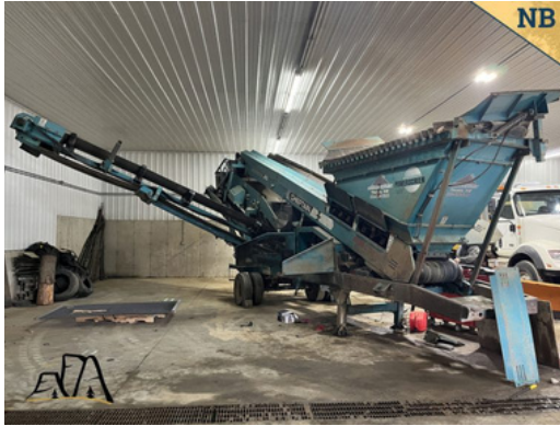
2011 Powerscreen Chieftain 400 Screening Plant Call for pricing

LATEST LISTINGS: CRUSHING/SCREENING • ASPHALT & PAVING EXCAVATORS • LOADERS • BACKHOES • DOZERS • DUMP TRUCKS FORESTRY • TRUCK TRACTORS • TRAILERS • SNOW EQUIPMENT & MORE