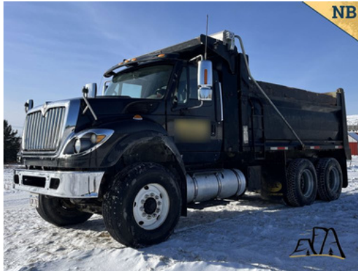
2012 International Workstar 7500 T/A Dump Truck Asking $59,500