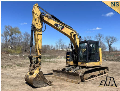
2013 CAT 314EL CR Hydraulic Excavator Asking $85,000