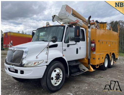
2004 International 4400 Durastar Bucket Truck $49,500