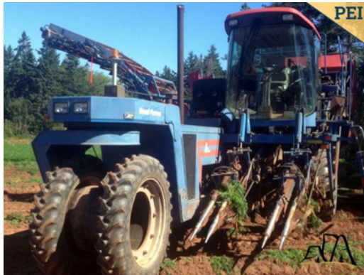
2001 Asa Lift SP200 Carrot Harvester Asking $180,000