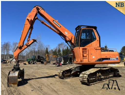
2008 Doosan 225LL Log Loader $135,000