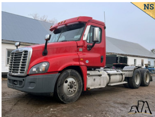
2016 Freightliner Cascadia 125 Day Cab Asking $33,900