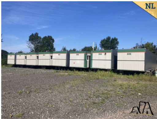
2012 GNS 47-Person Industrial Camp Trailers Asking $625,000