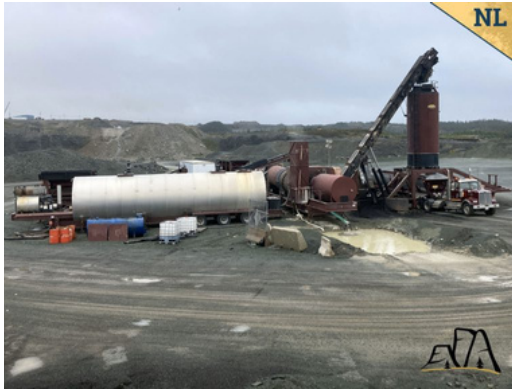
2017 ADM RB250 Asphalt Plant Asking $2,750,000