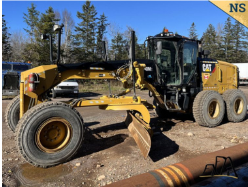
2014 CAT 140M VHP Plus Grader Asking $249,000