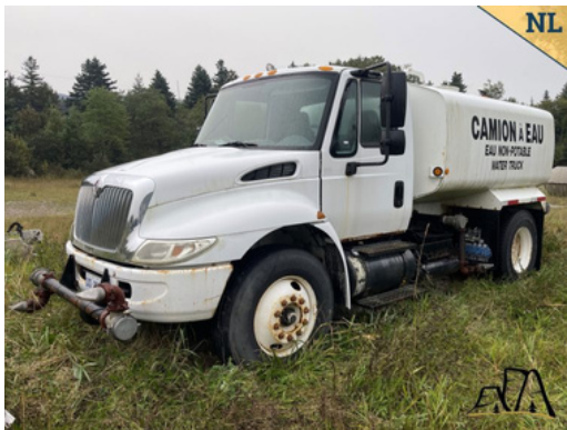
2005 International 4300 S/A Water Truck Asking $37,500