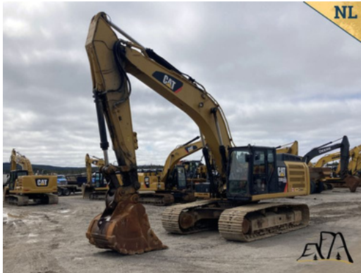
2014 CAT 336EL Hydraulic Excavator Asking $220,000