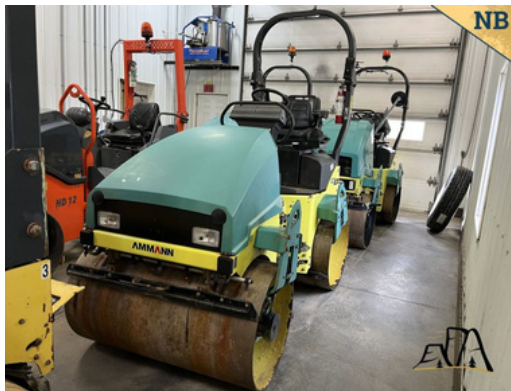
2018 Ammann ARX26 Double Drum Roller Asking $29,000