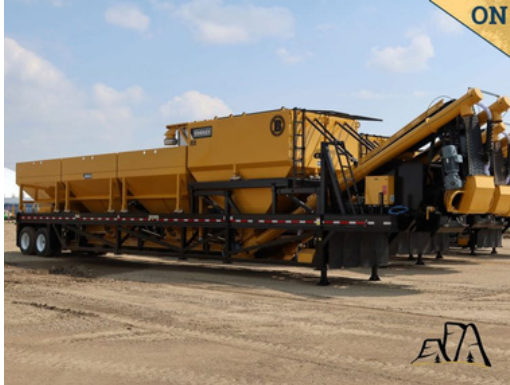
2024 Bohringer B-120 Concrete Batch Plant Asking $650,000