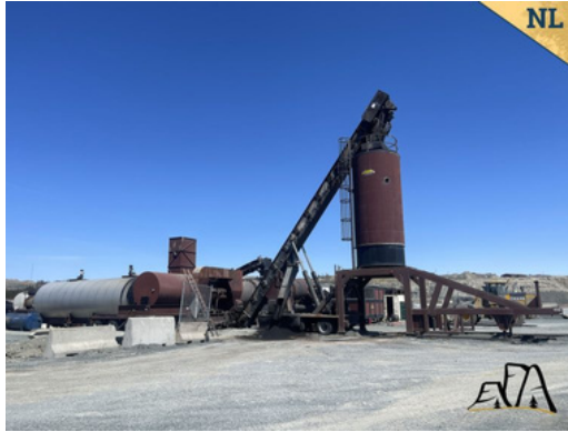
2017 ADM RB250 Portable Asphalt Plant Asking $1,950,000

LATEST LISTINGS: CRUSHING/SCREENING • ASPHALT & PAVING EXCAVATORS • LOADERS • BACKHOES • DOZERS • DUMP TRUCKS FORESTRY • TRUCK TRACTORS • TRAILERS • SNOW EQUIPMENT & MORE