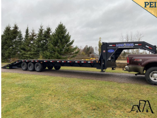
2023 Load Trail Tri/A Gooseneck Trailer Asking $29,000