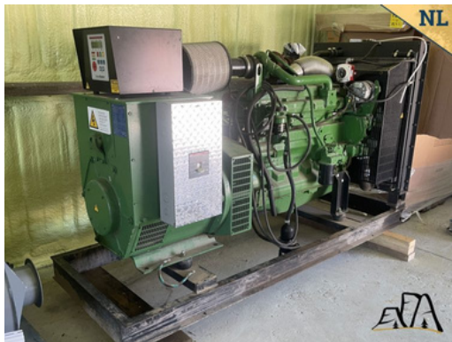
2010 AB Skid Mounted Generator Asking $110,000