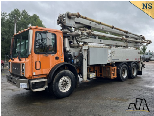
2006 Mack MR688S Concrete Pump Truck Asking $119,000