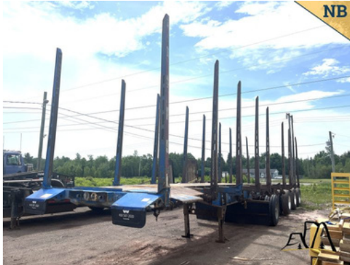
2018 Temisko 49' Q/A Log Trailer Asking $33,000