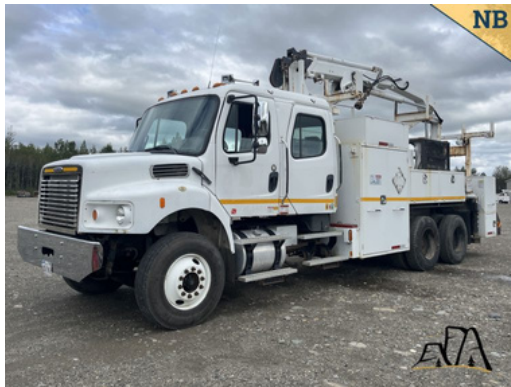
2006 Freightliner M2 106 / National N65A Boom Truck $46,500