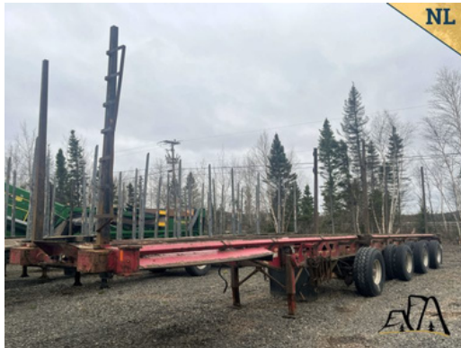
2016 BWS 46' Quad-Axle Log Trailer Asking $52,000