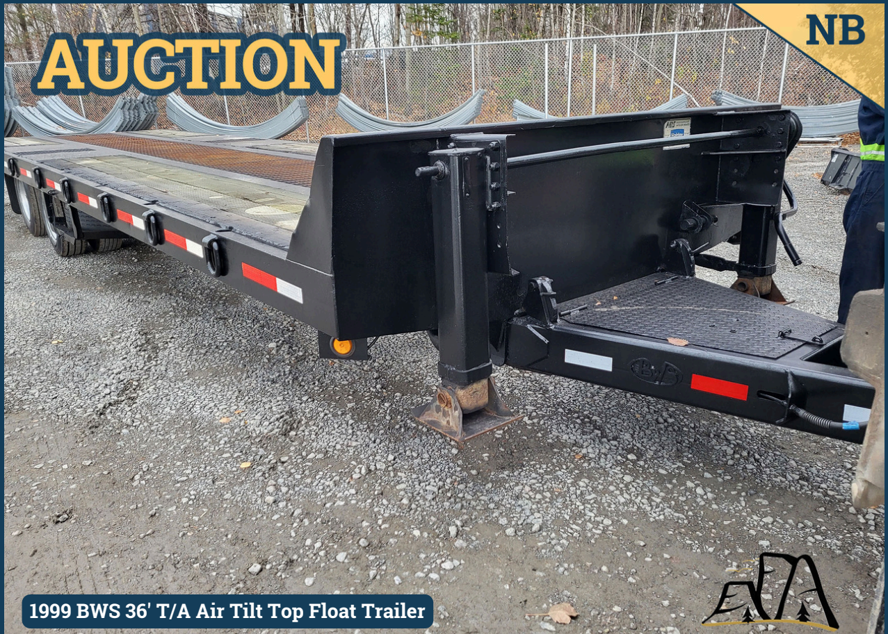
1999 BWS 36' T/A Air Tilt Top Float Trailer