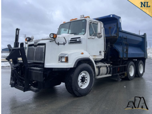
2013 Western Star 4700SB Plow/Spreader Truck Asking $130,000