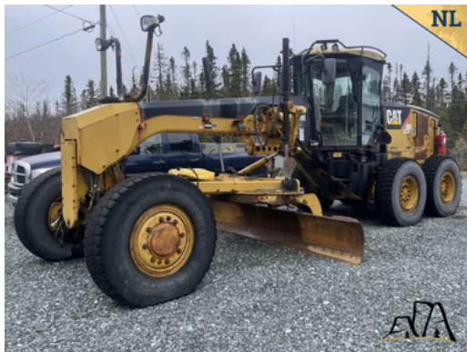
2011 CAT 140M AWD