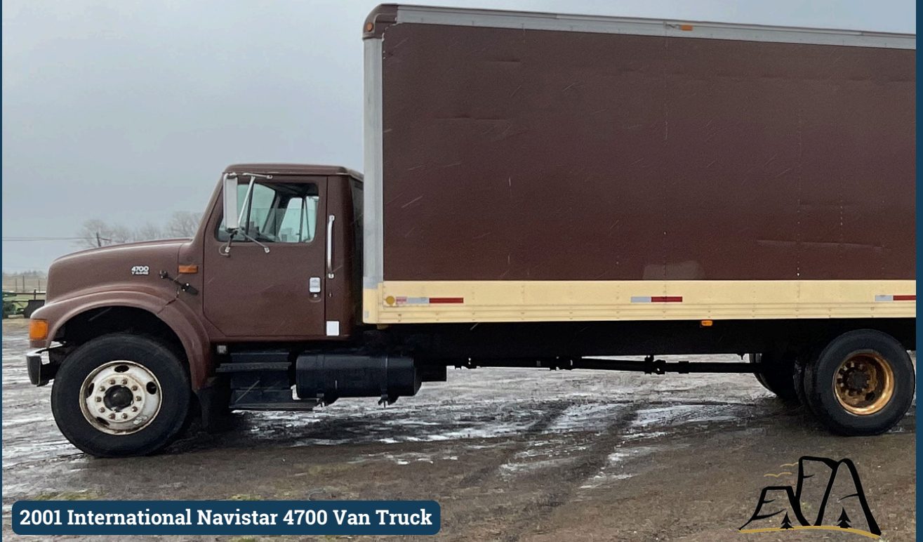
2001 International Navistar 4700 Van Truck