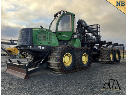
2016 John Deere 1910E Forwarder Asking $220,000

SALES@EASTERNFRONTIER.CA TEL. (866) 500-1196