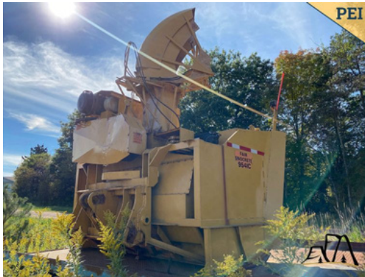
Loader-Mount Snow Blower Asking $22,000