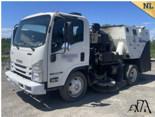
2017 Isuzu NPR HD / SuperVac GaleForce Vacuum Truck Asking $98,500