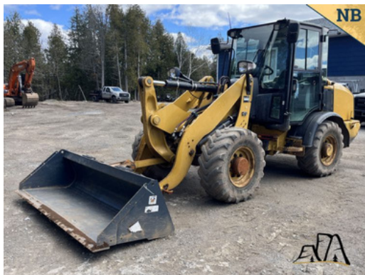
2019 CAT 906M Wheel Loader