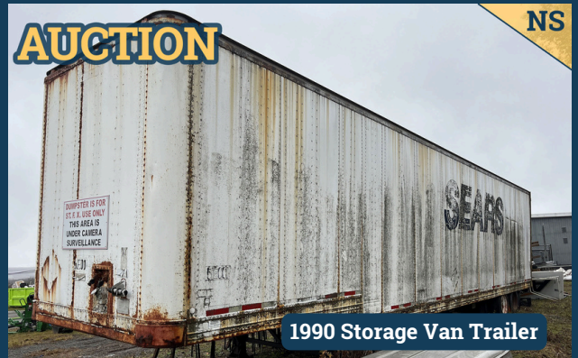
1990 Storage Van Trailer