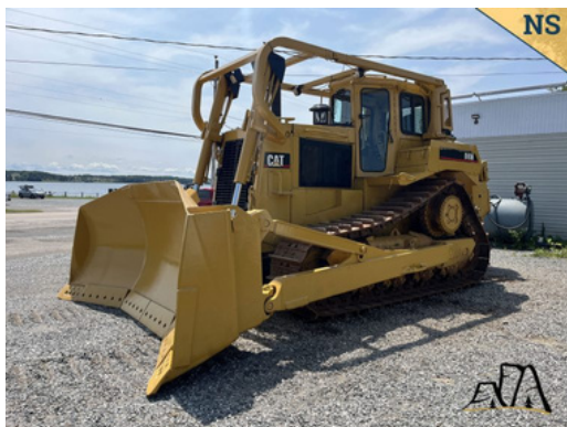
1995 CAT D8N