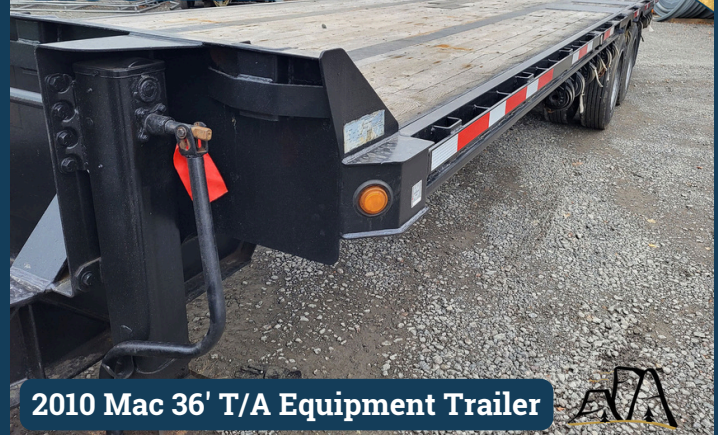
2010 Mac 36' T/A Equipment Trailer