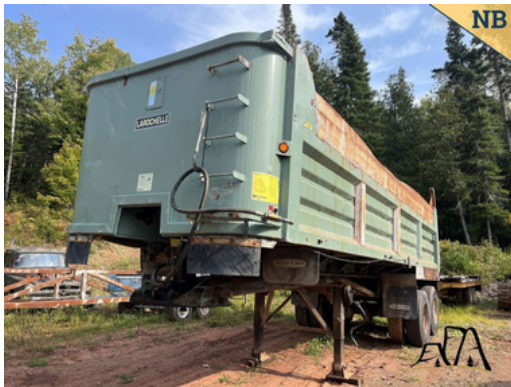
2000 Larochele 27' T/A End Dump Trailer Asking $17,500