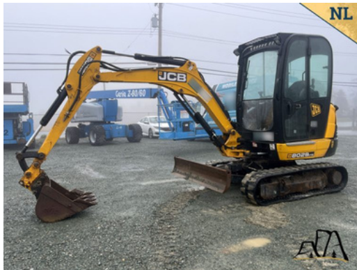
2022 JCB 8029 CTS Mini Hydraulic Excavator Asking $64,500