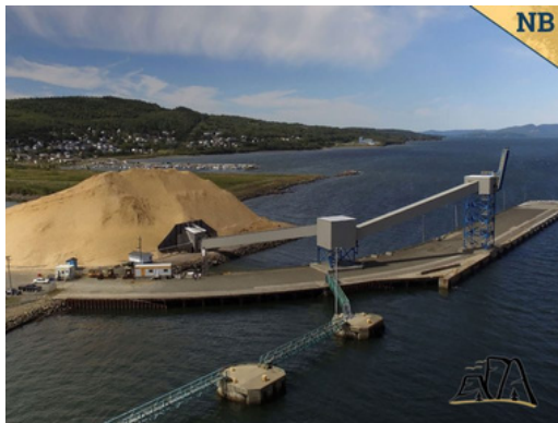
2010 Sparta Innovations Ship Loading Conveyor System Asking $500,000