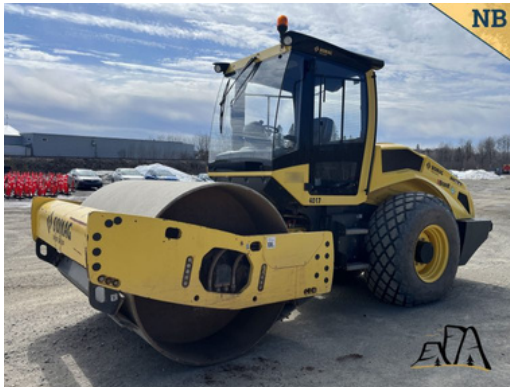
2019 Bomag BW211D Smooth Drum Compactor Asking $120,000