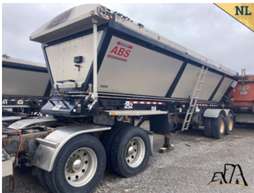
2010 ABS RC231 T/A Live Bottom Trailer Asking $48,500