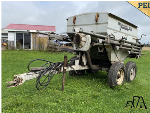
1998 Valmar 500 Pull-Type Fertilizer Spreader Asking $8,000