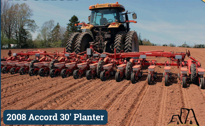
2008 Accord 30' Planter