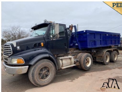
2001 Sterling Lift Truck / 2015 UniLift TAL57000C Asking $65,000