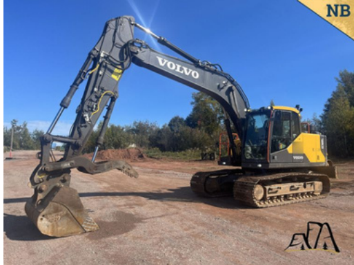
2023 Volvo EC160EL Hydraulic Excavator Asking $235,000