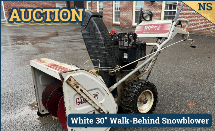
White 30" Walk-Behind Snowblower