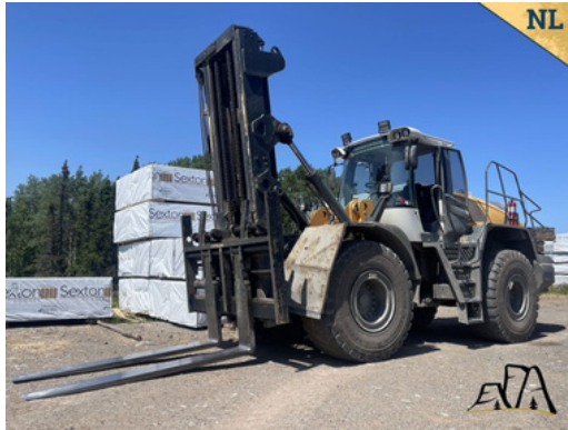
2014 Liebherr L550 Loader/Forklift Asking $74,900