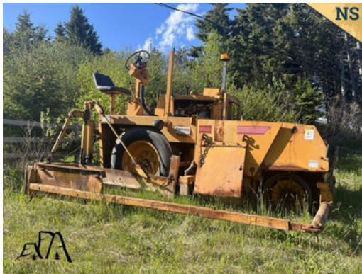
Blaw-Knox Road Widener Asking $38,500