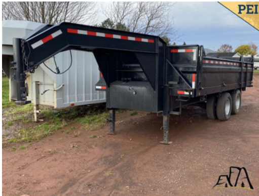
2013 Load Trail Heavy Duty T/A Dump Trailer Asking $20,000