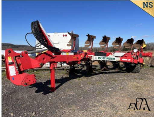
2009 Pottinger SERVO 6.50 Nova Plus 6 Furrow Plough Asking $19,500