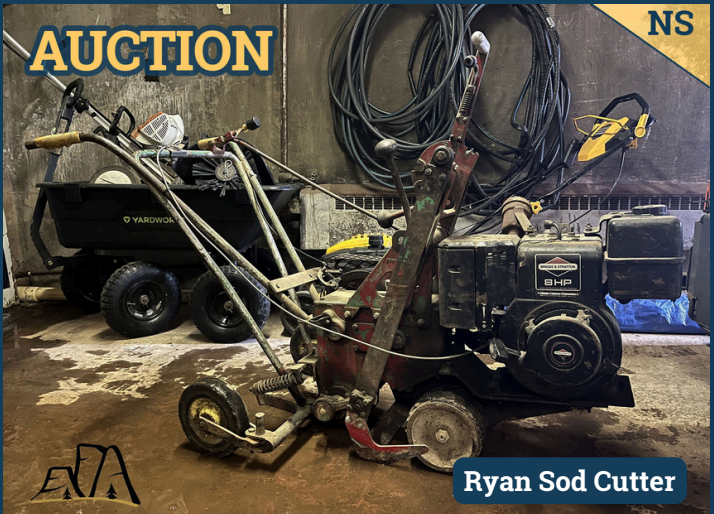
Ryan Sod Cutter