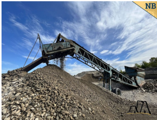
1992 Powerscreen MKII Screener Asking $45,000