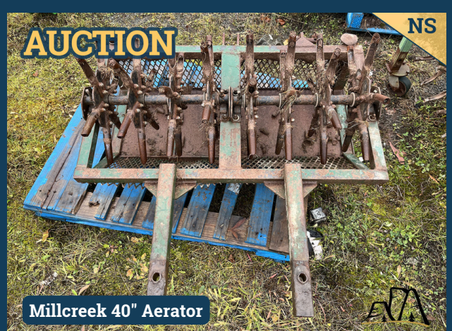
Millcreek 40" Aerator

REGISTER TODAY: easternfrontier.ca/auctions