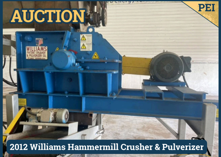
2012 Williams Hammermill Crusher & Pulverizer