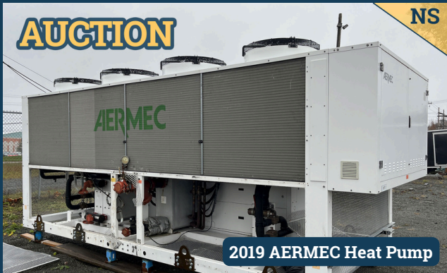
2019 AERMEC Heat Pump