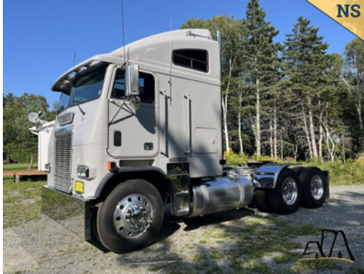
1993 Freightliner FLA Cab-Over Sleeper Truck $80,000