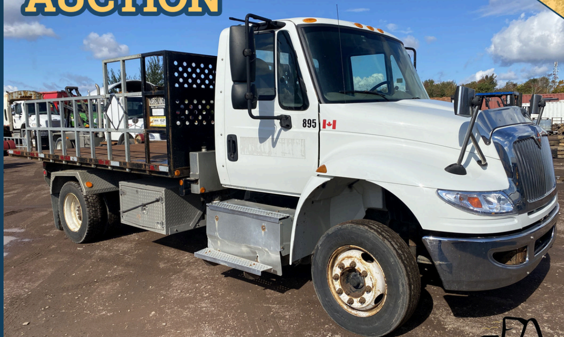
2016 International 4300 Roll-off Truck