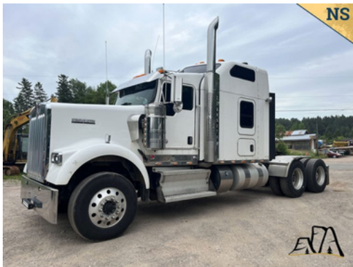
2019 Kenworth W900L Sleeper Truck Asking $100,000