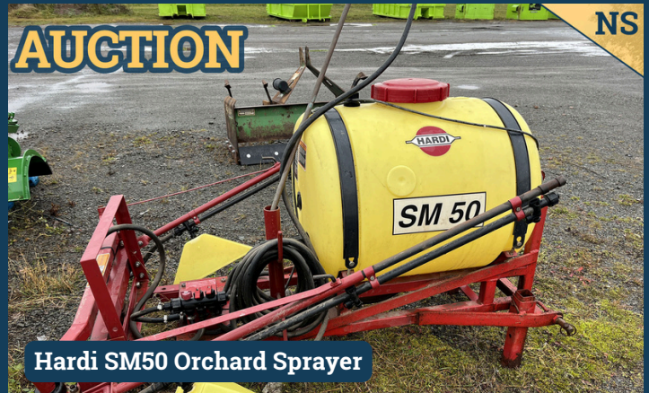
Hardi SM50 Orchard Sprayer