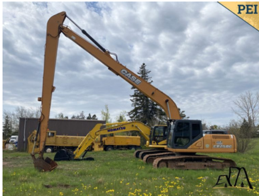
2012 Case CX250C Long Reach Excavator Asking $180,000