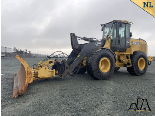
2012 Deere 624K Wheel Loader Asking $164,900