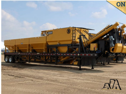
2024 Bohringer B-120 Concrete Batch Plant Asking $650,000