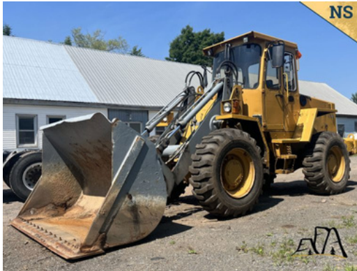
1993 Volvo L50 Wheel Loader Asking $33,000