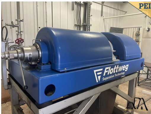
2009 Flottweg High Performance Decanter Asking $60,000