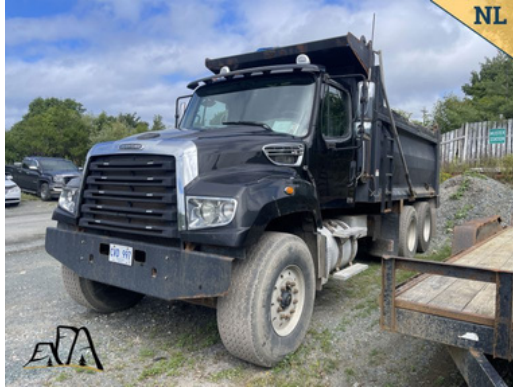
2013 Freightliner 114SD T/A Dump Truck Asking $95,000