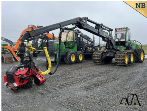
2018 John Deere 1170G Harvester $245,000