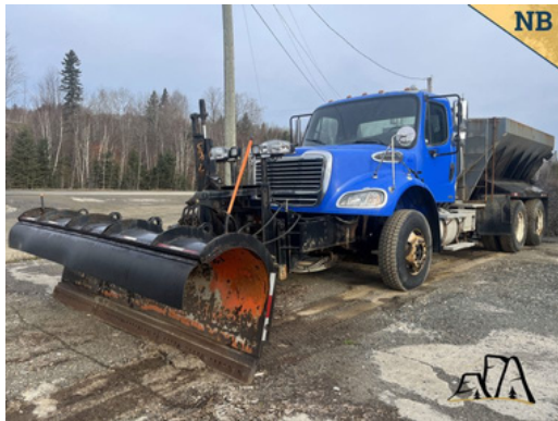
2009 Freightliner M2 112 Plow/Spreader Truck Asking $65,000