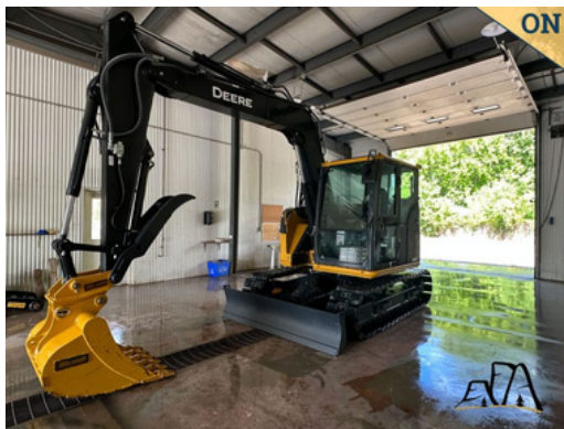
2024 Deere 75P Mini Hydraulic Excavator Asking $208,890