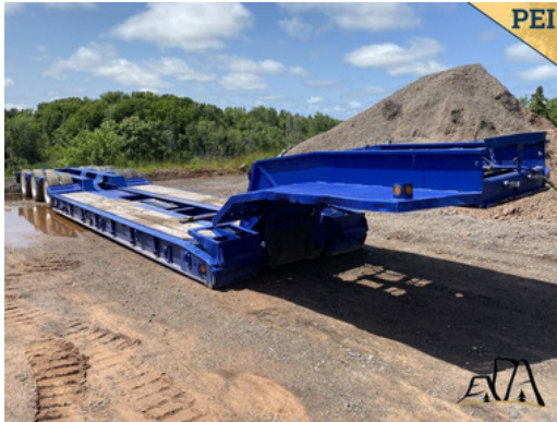
1987 Lode King 40' Tri/A Lowboy Trailer Asking $35,000