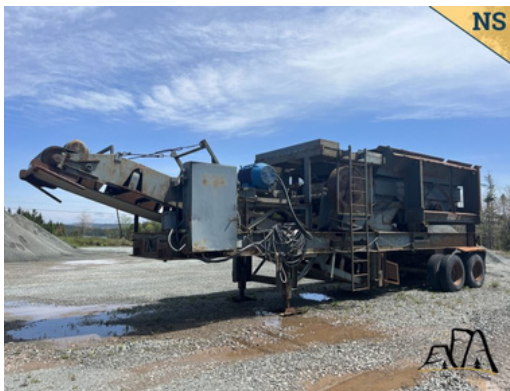
1981 Cedarapids VA-VGF2236 Portable Jaw Crusher Asking $99,500