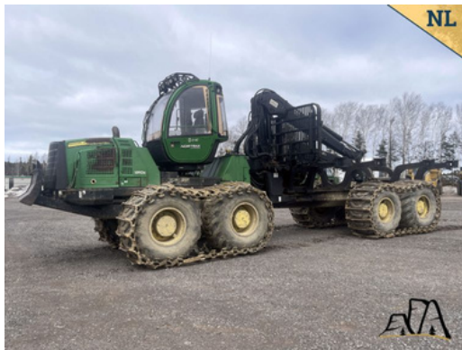
2014 John Deere 1910E Forwarder Asking $250,000