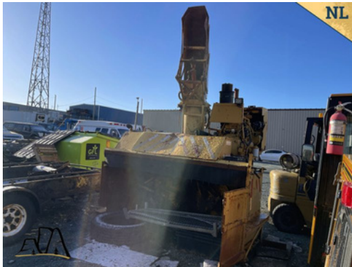
2002 Snocrete 8' Snow Blower Attachment Asking $9,800