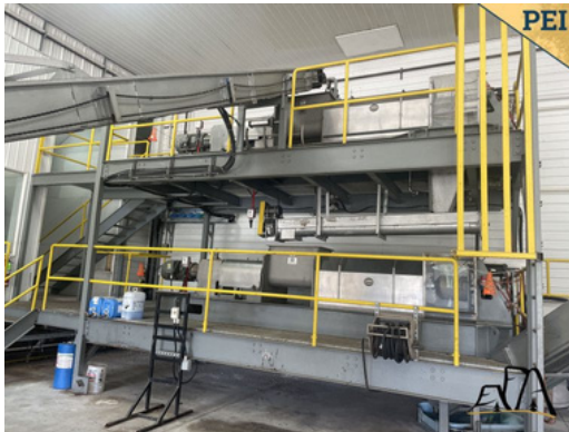
2009 Vincent 2-Level Press Asking $200,000