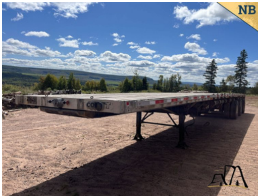
2010 Transcraft Eagle 48' Tri/A Highboy Trailer Asking $23,000