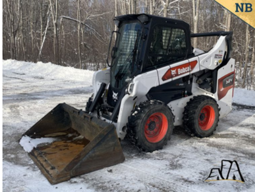
2021 Bobcat S64 Skid Steer Loader Asking $60,000