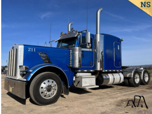
2021 Peterbilt 389 Flattop Sleeper Truck $178,500