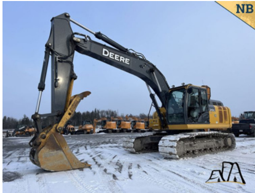
2018 Deere 210G LC Hydraulic Excavator Asking $229,000