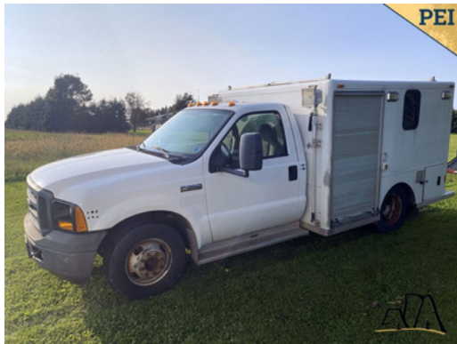
2006 Ford F350 Mechanics Truck Asking $28,000