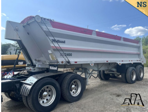
2005 Midland SX2400 Scissor Dump Trailer Asking $38,000