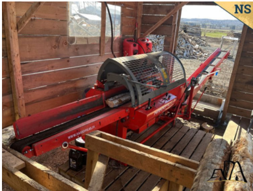
2021 Hakkipilke Falcon 35 Firewood Processor Asking $27,900