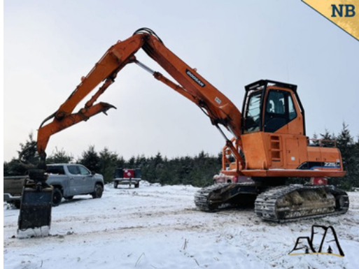
2008 Doosan 225LL Log Loader Asking $135,000

SALES@EASTERNFRONTIER.CA TEL. (866) 500-1196