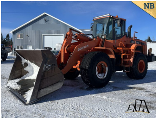
2007 Doosan DL300 Wheel Loader Asking $58,000