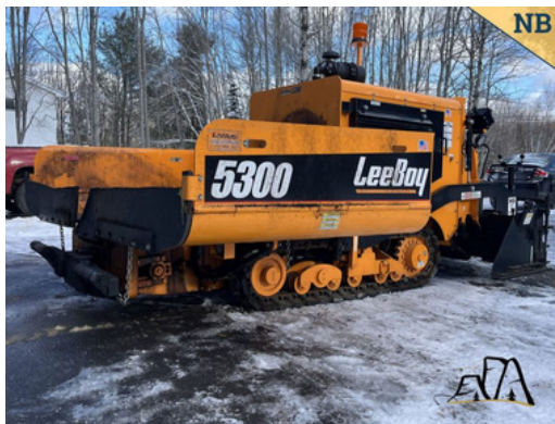
2019 LeeBoy 5300 Paver Asking $159,000