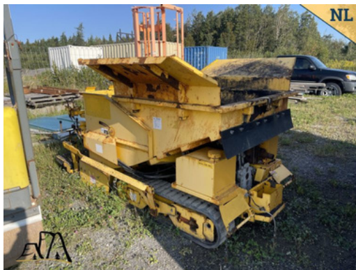
Salsco TP411 Track Paver Asking $32,500