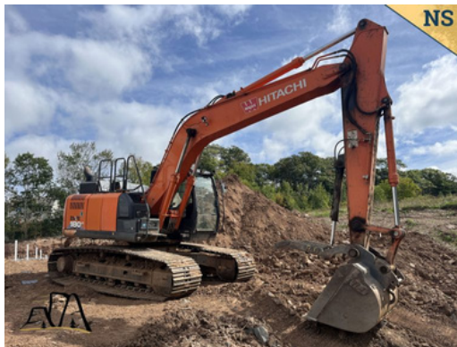
2019 Hitachi ZX180 LC-6N Hydraulic Excavator Asking $155,000