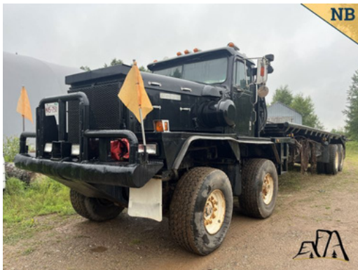
1980 Pacific Tandem Tandem Bed Truck Asking $45,000