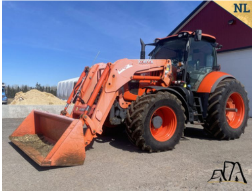
2017 Kubota M7-171H 4WD Tractor Asking $190,000