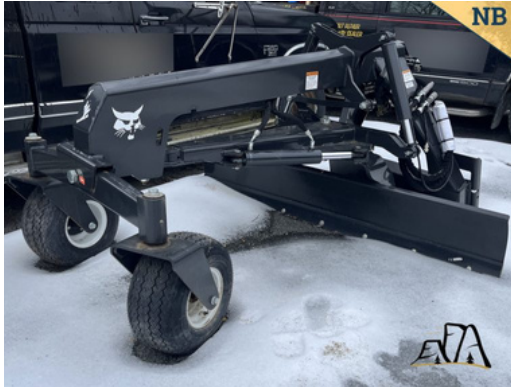
2022 Bobcat 84" Blade Skid Steer/Grader Attachment Asking $17,000