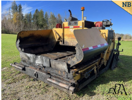
2007 LeeBoy L8515T Asphalt Paver Asking $40,000