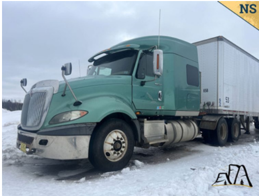
2014 International ProStar+ Eagle Sleeper Truck $27,900