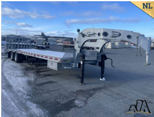
2022 Maxi-Roule Cobra T/A Gooseneck Trailer Asking $47,500