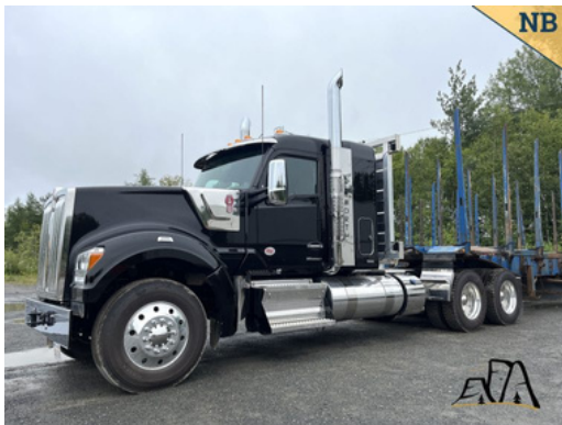
2025 Kenworth W990 Sleeper Truck $239,500 (1 of 2 available)