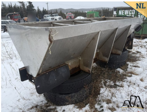
Equifab Stainless Steel Salt Spreader Box Asking $1,000