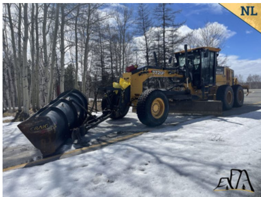
2015 John Deere 772GP Motor Grader Asking $395,000