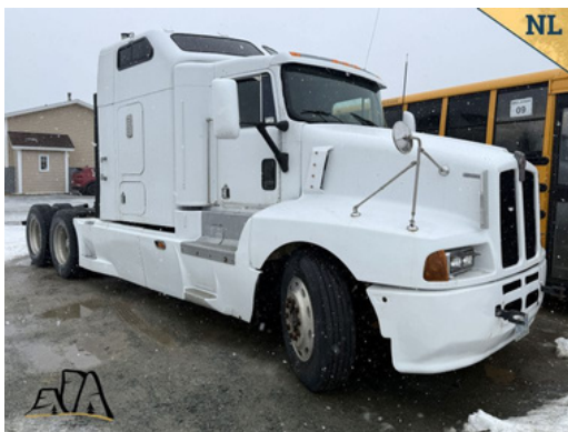
1991 Kenworth Limited Edition T/A Sleeper Truck Asking $19,900