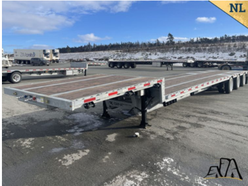
2023 Gincor 53' Tri/A Drop Deck Trailer Asking $85,000