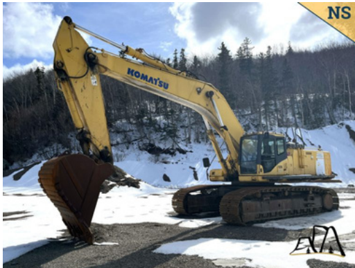
2006 Komatsu PC600LC-8 Hydraulic Excavator Asking $105,000