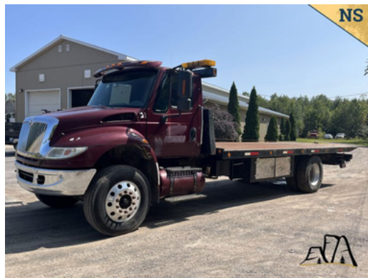
2007 International 4400 Roll-Back Tow Truck Asking $23,000

*for DUMP TRUCKS, see pg 8 *for TRUCK TRACTORS, pg 7