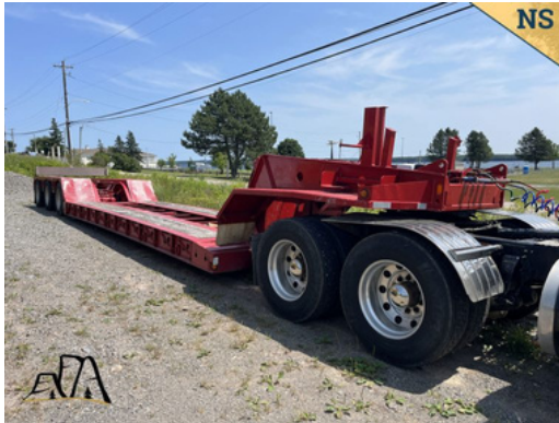
2005 Scheltema Tri/A Detachable Lowboy Trailer Asking $75,000