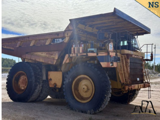
2002 CAT 777D Rock Truck Asking $77,500