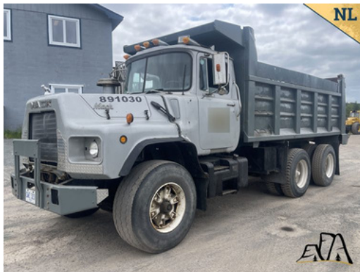
1989 Mack DM690S T/A Dump Truck Asking $21,500 (1 of 3 available)