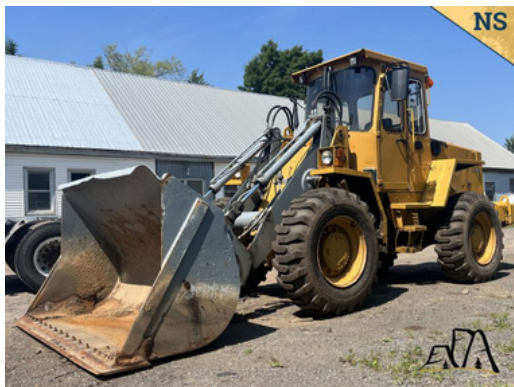
1993 Volvo L50 Wheel Loader Asking $33,000