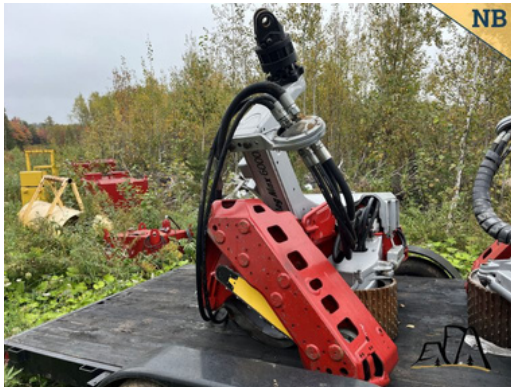
2018 Log Max 6000B Harvester Head Asking $69,500