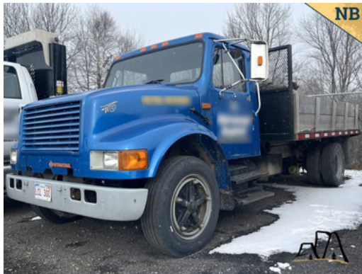
1990 International 4700 S/A Dump Truck Asking $15,000