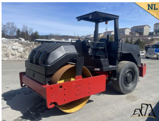
1997 Dynapac CA151A Vibratory Roller Asking $24,500