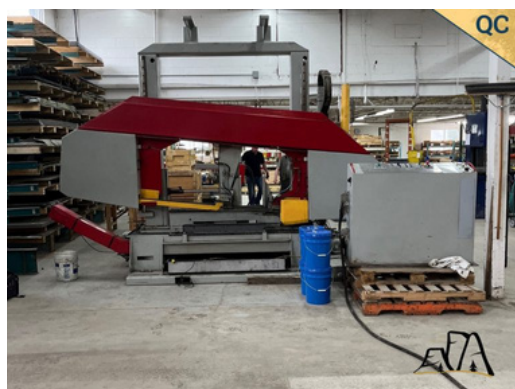
2006 Bomar 820 Extended Horizontal Band Saw Asking $45,000