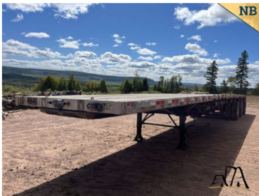
2010 Transcraft Eagle 48' Tri/A Highboy Trailer Asking $23,000