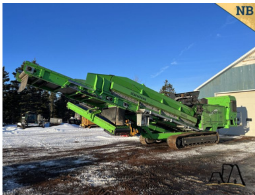
2017 Neuenhauser Starscreen Screening Plant Asking $325,000