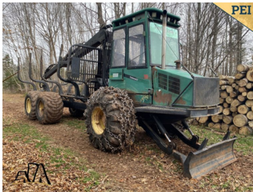
1998 Timberjack 1010B Skidder Asking $50,000