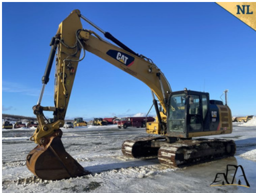
2017 CAT 323FL Hydraulic Excavator Asking $165,000