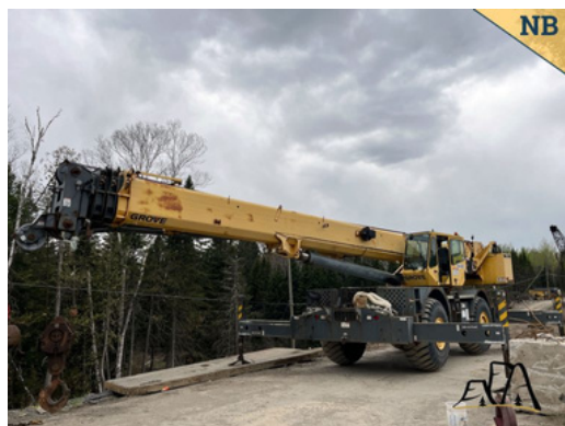
2009 Grove RT880E Rough Terrain Crane Asking $300,000