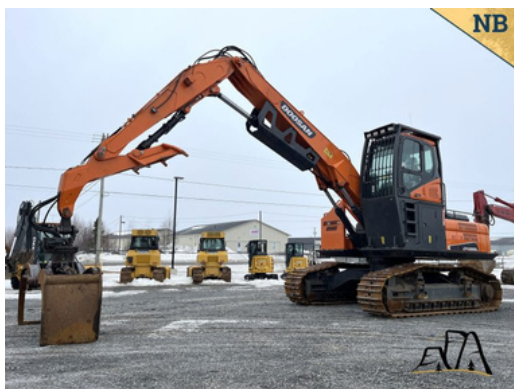
2022 Doosan DX225LL Log Loader Asking $235,000