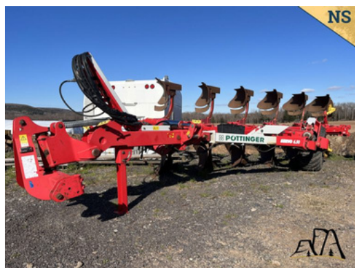
2009 Pottinger SERVO 6.50 Nova Plus 6 Furrow Plough Asking $19,500