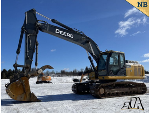
2018 Deere 210G LC Hydraulic Excavator Asking $219,000