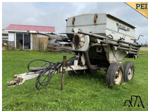
1998 Valmar 500 Pull-Type Fertilizer Spreader Asking $8,000