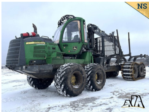
2019 John Deere 1510G Forwarder Asking $335,000

SALES@EASTERNFRONTIER.CA TEL. (866) 500-1196